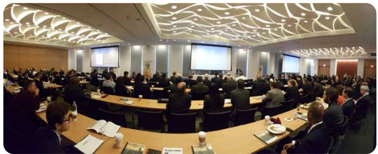
One of The Family Office Club's 10 Annual Conferences